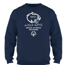
Example: Navy sweatshirt in crewneck style

Use this link to place an order. http://willpromo.com/wild_kats_spiritwear