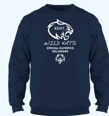
Example: Navy sweatshirt in crewneck style

In an effort to provide athletes, families and fans with access to Special Olympics Delaware spiritwear, all areas will now have the opportunity to order area wearables and gear at any time with our new and secure vendor-based online ordering system! T-shirts, sweatpants, crew and zip up sweatshirts and hoodies will be available. New this year are tank tops, mesh shorts, twill caps and drawstring backpacks!