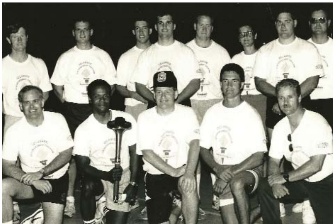
Every year, more than 750 Delaware law enforcement officers participate in Special Olympics as Guardians of the Flame. In the 25-year history of Delaware Law Enforcement for Special Olympics, over $3.5 million has been raised.

The Law Enforcement Torch Run is a worldwide story of success, friendship, respect and commitment between law enforcement officers and Special Olympics athletes. Law enforcement officers carry the Flame of Hope to the Opening Ceremonies of local, national and international Special Olympics games - raising money and awareness for Special Olympics along the way.