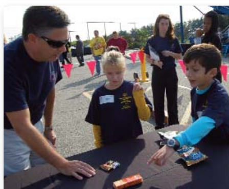
Volunteers from Bank of America (below) conducted the Healthy Athletes program at the 2011 NCCo soccer skills events at UD. A Bank of America employee helps a Special Olympics athlete at the balance beam station (top photo) and at the “healthy choices” nutrition table (shown above).