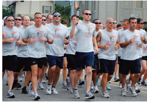
Law enforcement torch runners carry the torch through Wilmington en route to the 2011 Summer Games

That bond is made up of over 1,000 law enforcement personnel, including chiefs, patrolmen, officers, deputies, and agents from every branch of federal, state, county and municipal agencies. These individuals, collectively, have dedicated their time and support over the years to raising funds and awareness for over 3,500 Special Olympics Delaware athletes.