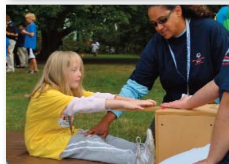
Nursing students from DelTech (Georgetown) help with the hand-washing station (top) and at the sit-and-reach station (above) during the Sussex County soccer skills event